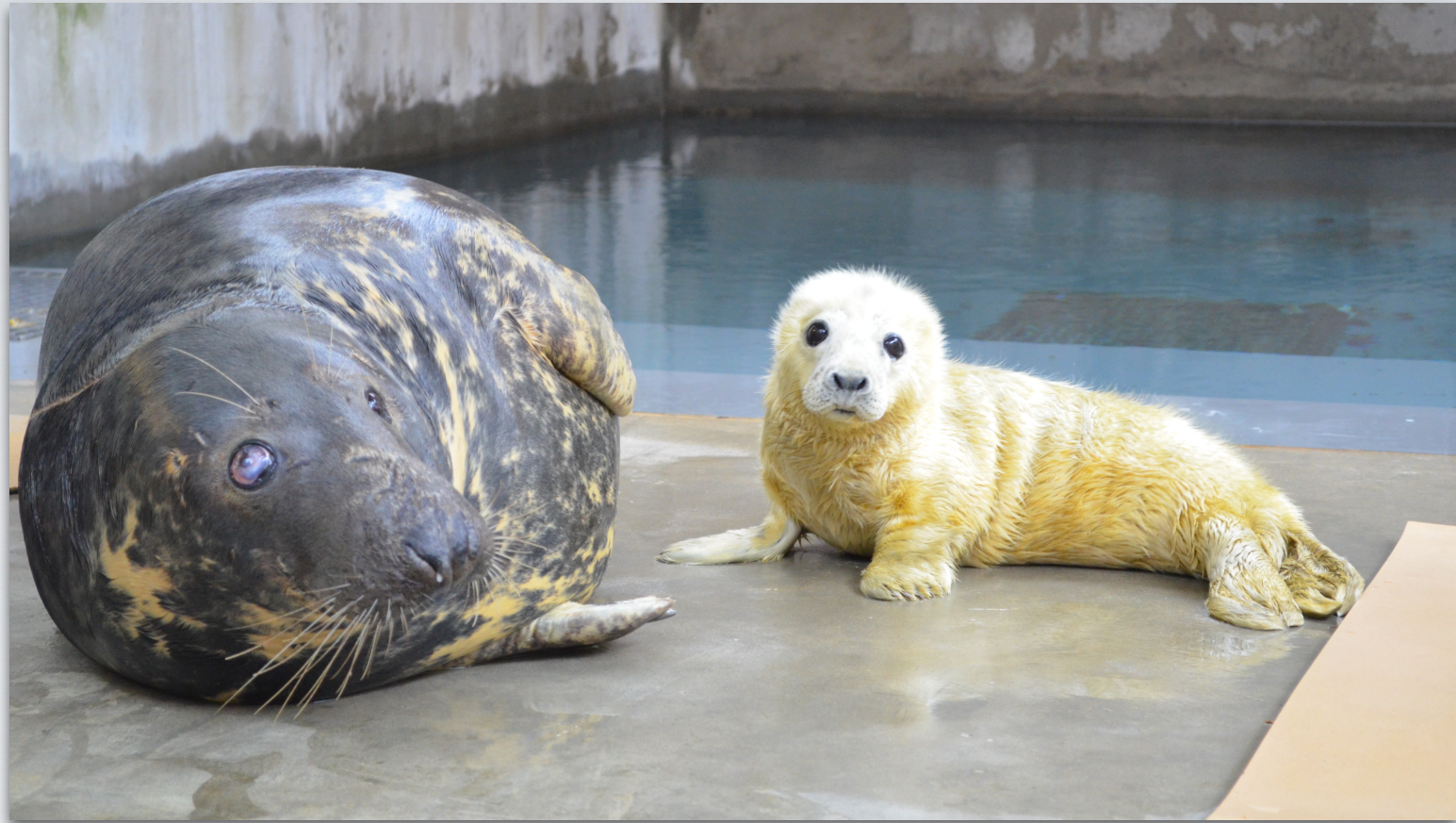
Mom and Pup Seal at Smithsonian's National Zoo