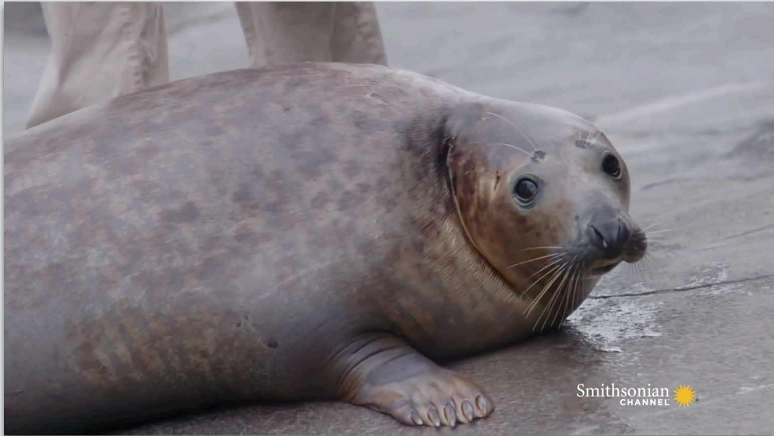
Sea Lions vs. Seals