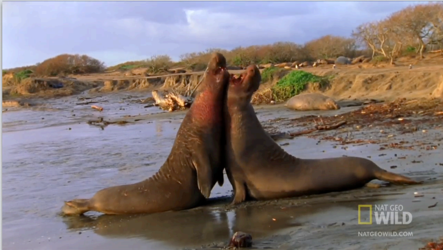
Elephant Seal Battle [graphic]