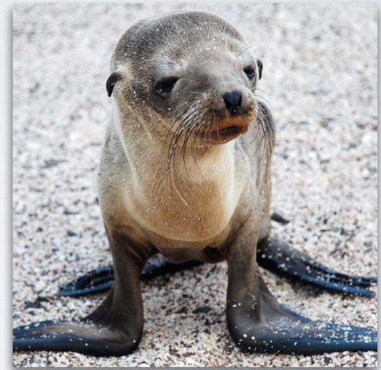
Galapagos Sea Lion