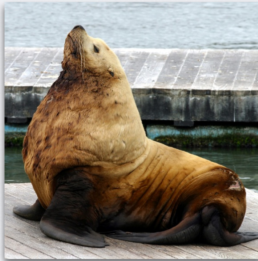
Steller Sea Lion