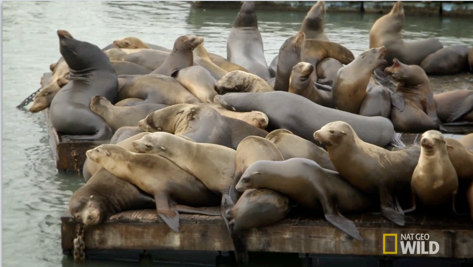
San Francisco Sea Lion