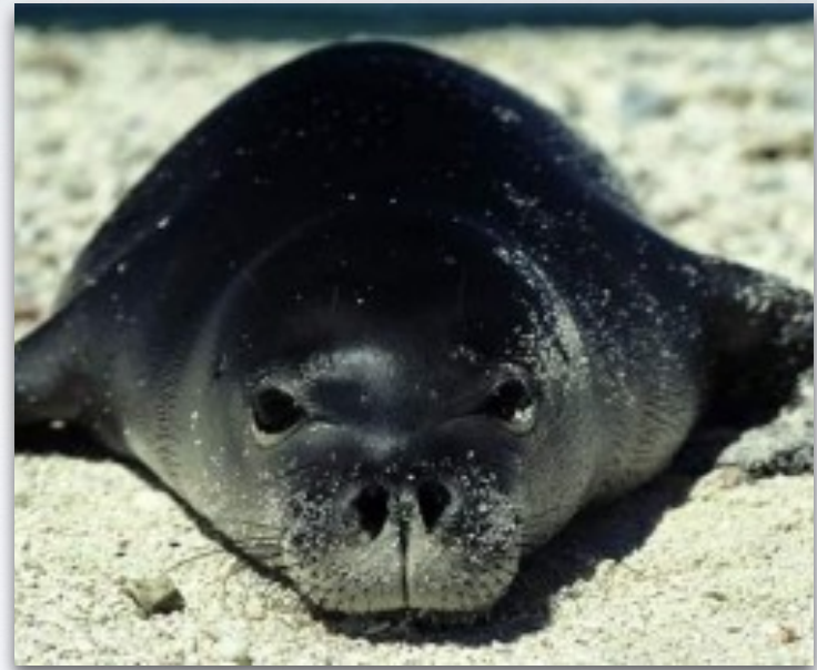
Caribbean Monk Seal