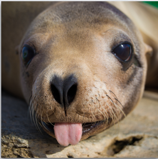
California Sea Lion