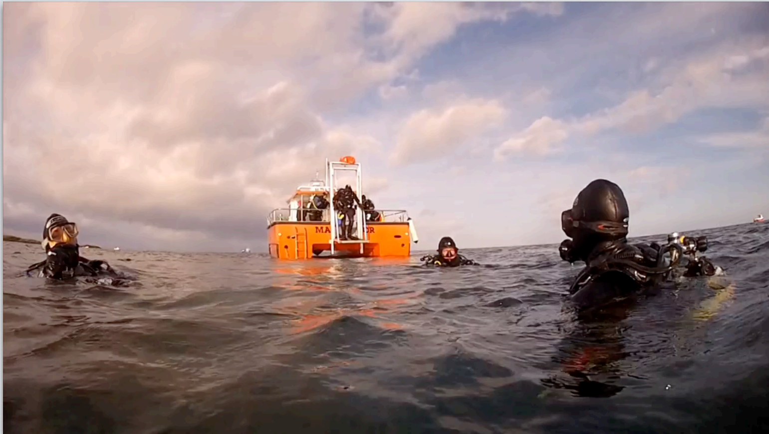
Seal on the Move